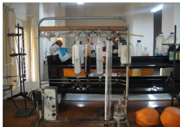
Figure 4: Orsat gas analyser is ready to analyse CH 4 and CO 2 .

the known amounts of CO 2 , H 2 S and CO from the gas sample. The Orsat equipment used to determine biogas compositions are shown in Figure 4. The measurements were used to determine the ratio of methane to carbon dioxide.