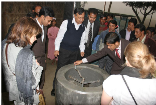
Figure 1: Feeding rice straw in a domestic experimental biogas plant.

plant was of a fixed brick dome design that is built in good numbers across Bangladesh. The rice straw had been left in a heap in the market for 15 days, so had already started to break down.