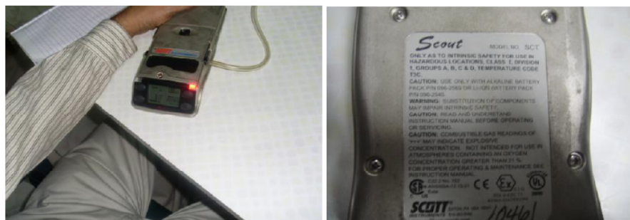
Figure 3: The digital gas analyser is used for biogas analysis at BCSIR's laboratory.

down to a slow steady rate (from the activity of the microbes), the reading of the total gas measured was taken, giving a figure of the total gas produced over the previous 24 hours.