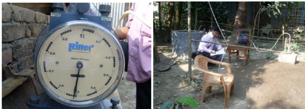
Figure 2: The digital flow meter is used to measure the biogas yield at a test site.

The biogas yield was measured using two methods. An underground biogas plant is able to store gas using the displacement principle, in which slurry is pushed into a reservoir by gas pressure. In the first method, the plant was allowed to produce and store gas for 24 hours. Then the gas was released into a gas balloon through the gas meter. When the gas flow slowed