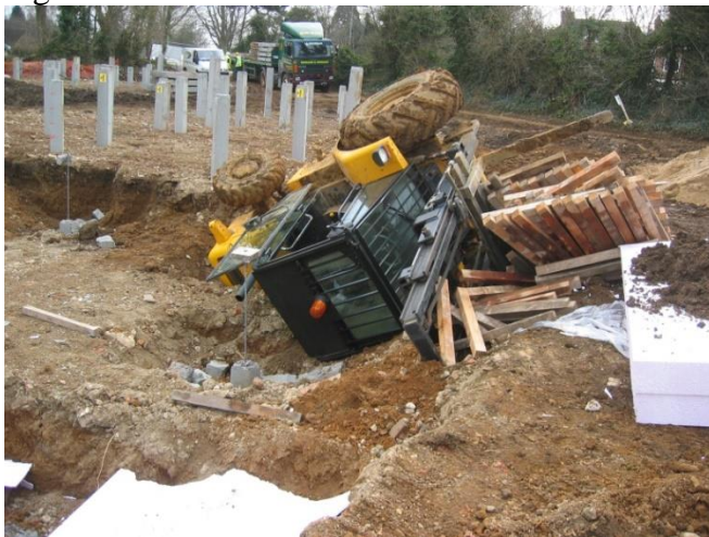
Figure 1 – Overturned masted forklift truck

Case study #4: An operator is killed whilst conducting maintenance on a top cutter.