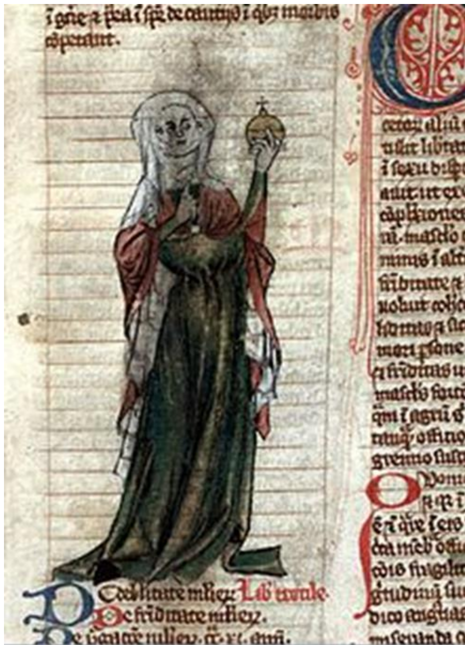
Image I: Trotta of Salerno Wellcome Library, MS 544 ( Miscellanea medica XVIII ) Early 14 th century, France