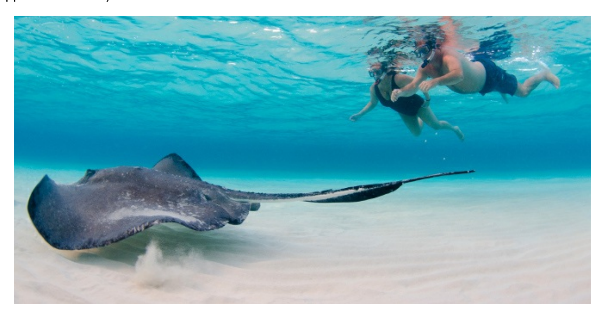
There is increasing scrutiny of what's going on beneath the surface in the Cayman Islands

All wrong! It's the Cayman Islands, a tiny group of islands in the Caribbean just south of Cuba. In 2015, the stock of FDI from Brazil into the Cayman Islands amounted to a staggering US$52 billion (with US$2.5 billion going in the opposite direction). This represents over one third of total outward FDI from Brazil. What's more, investors domiciled in the Cayman Islands hold portfolio investment in Brazil worth over US$26 billion (with US$2.6 billion in the opposite direction).