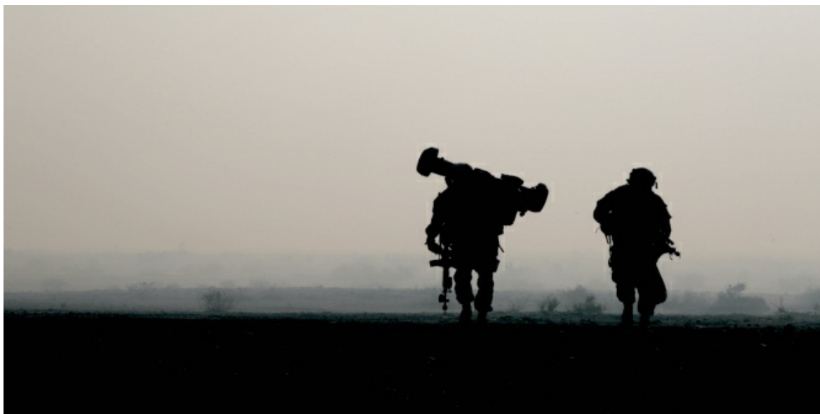
4th Infantry Division at National Training Center