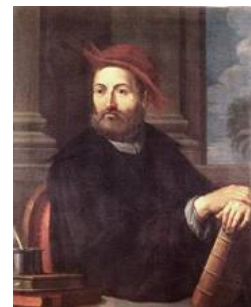
Fig. 5 - Andrea Cesalpino

One of the founders of botany Andrea Cesalpino (1525-1603) (Fig. 5), also known as Caesalpinus, studied under Realdo Colombo and Luca Ghini in Pisa, where he received his degree in 1551. Later in 1555 he succeeded Ghini as director of the Botanical Garden of Pisa and as lecturer of medicine. Cesalpino was Chair of Medicine from 1569 to 1592, when he moved to Rome where he served as physician to Pope Clement VIII and taught medicine at the Sapienza University [15].