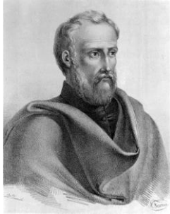
Fig. 2 - Giovanni Battista Canano

important contribution by Canano was the first public demonstration of venous valves performed in 1547 [5, 8].