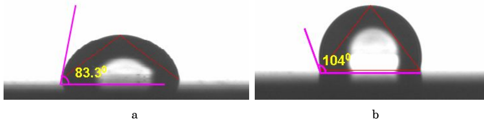
Fig. 3 – Contact angle figure (a) hydrophilic surface ( \theta = 83.3^\circ ), (b) hydrophobic surface ( \theta = 104^\circ )

The hydrophobic nature of the surface modified low-k thin film has been determined by the contact angle measurement of the water droplet on the surface of the low-k thin film using contact angle meter. In this process, the drop of water is added on top surface of the film and the water droplet is photographed. The contact angle has been calculated directly from software by using young’s equation. The contact angle of as deposited and surface modified film is shown in Figure 3a and b respectively. The contact angle of as deposited and surface modified film is observed to be 83.3° and 104° respectively. From the measured contact angle value it confirms that the hydrophilic surface of the film has become hydrophobic after wet chemical treatment, as the contact angle after modification is more than 90° [14].