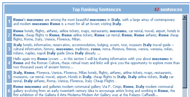
Figure 2: Top-ranking sentences

The second system, System 2 is an extension of System 1. In a similar way, the System 2 interface displays the titles of web pages in groups of ten, and presents summaries on request. However, the System 2 interface also displays a list of top-ranking sentences. In this system the same sentence extraction method that is applied to individual documents in System 1 is applied to the top thirty documents as a set . That is, we split the top thirty documents into component sentences and rank the sentences according to the words they contain and the query words they contain. This allows a ranking of the sentences from the top thirty documents – the top ranking sentences. More than one sentence per document can appear in the list of top-ranking sentences. The sentences themselves are displayed to the searcher as shown in Figure 2.