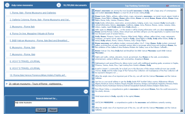
Figure 4: Top ranking sentences interface (Systems 2/3)

result list, Figure 3. Passing the mouse over this title will show a summary of the document.