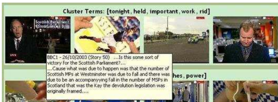
Figure 4. Cluster Interface - Result Display Example