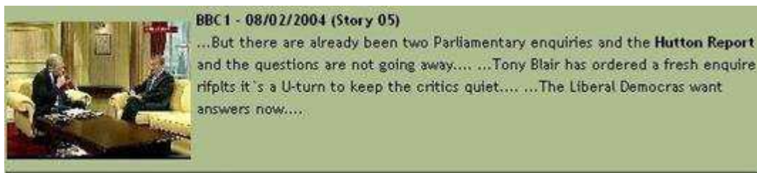
Figure 3. Summary Interface - Result Display Example