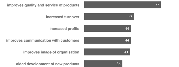
Chart 1:Design Contribution to Business Performance, Adapted from [20]

By 2005 the Hong Kong Design Centre (HKDC) and the Hong Kong Productivity Centre had realized the need to encourage SMEs to shift from OEM based business to developing and owning their products and brands (OBM). HKDCs Reinventing with Design programs in 2006-07 focused on demonstrating how SMEs can profitability shift from OEM based business to developing and owning their products and brands [OBM]. During this period two important factors emerged that were potential barriers to the adoption of design-led innovation in Chinese SMEs: [1] the perceived costs of undertaking design activities [Design Council, 2008] and [2] Chinese aversion to risk. The HKDCs Reinventing with Design programs in 2006-07 focused on several themes, two specifically concentrating on the financial benefits of investing in design and how companies reduce the risk of developing and owning their products and brands [19]. From undertaking and reviewing SME training program activities, run in conjunction with Hong Kong Productivity Council in 2006, it became apparent that Chinese SMEs appeared to respond more positively to numbers first [return on investment] and quality of design second. From these learnings, added value benefits associated with using design effectively were communicated to SMEs via a “numbers first strategy” at the 2006 Reinventing with Design [19]. Table 1 provides a summary of added value benefits associated with using design effectively.