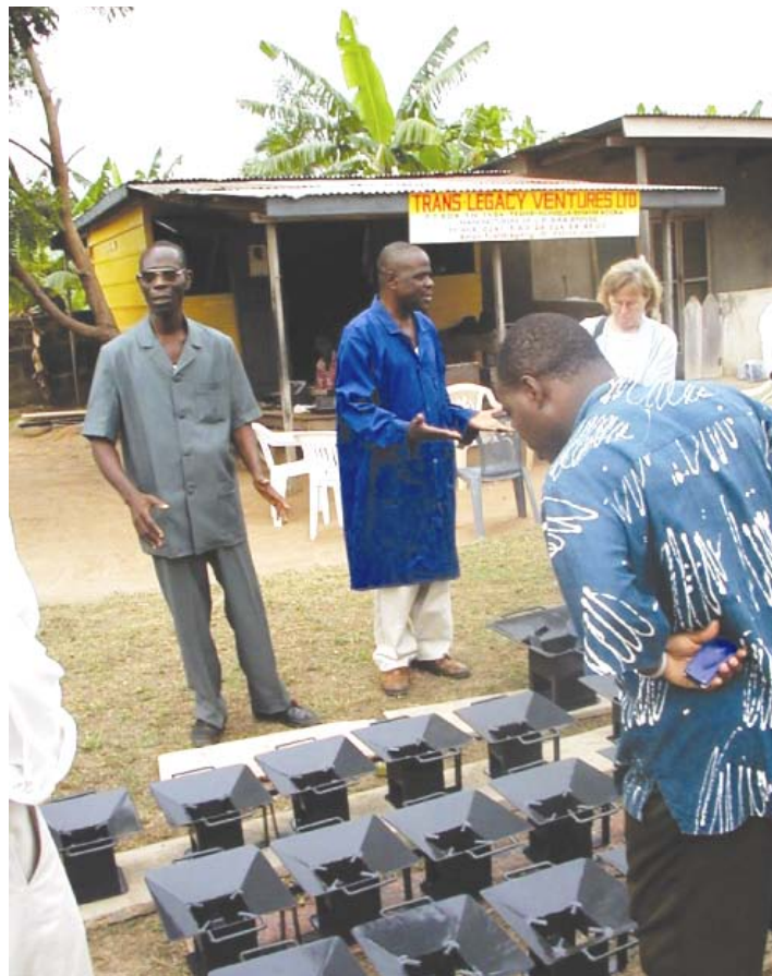
Fuel-efficient stove production at Trans-Legacy Ventures, Ghana