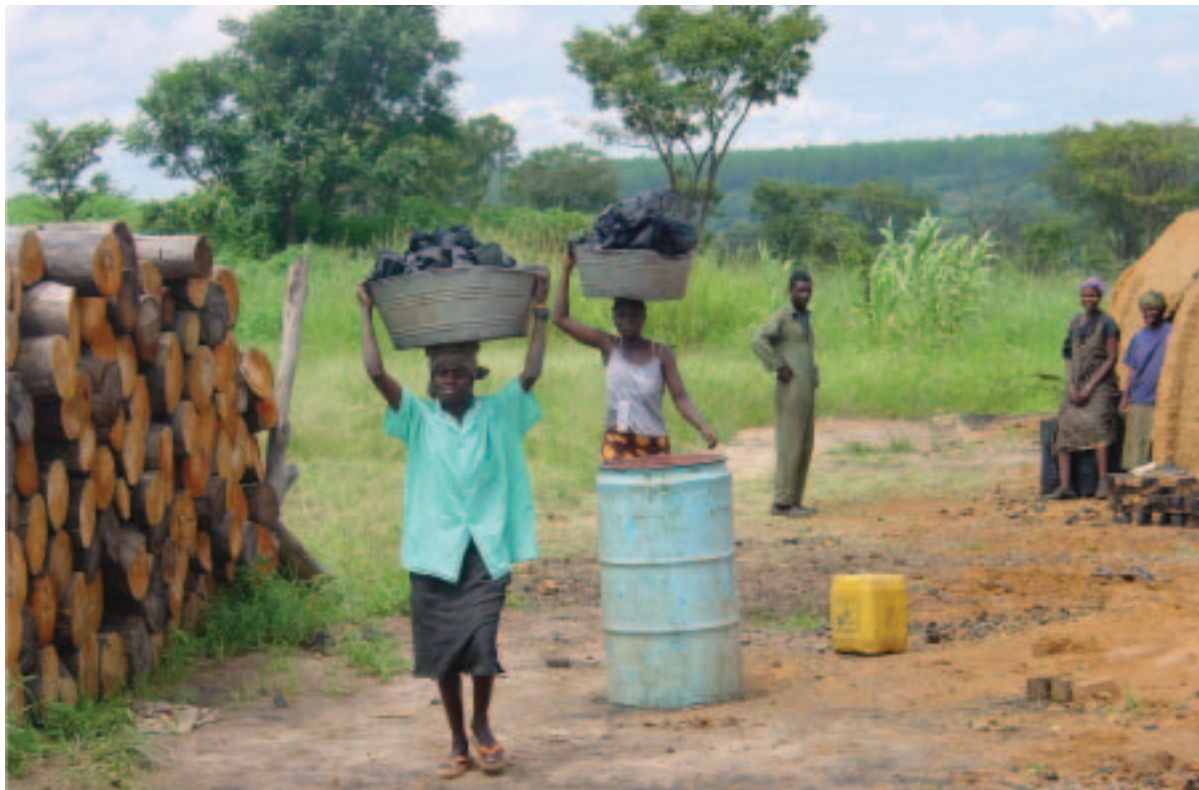
Charcoal production from forest off-cuts, using the 'half-orange' kiln, Copperbelt, Zambia