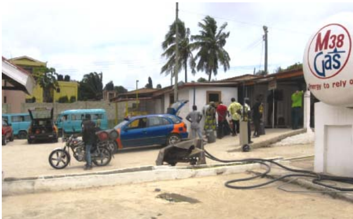
M38's refilling station in western Accra, September 2012