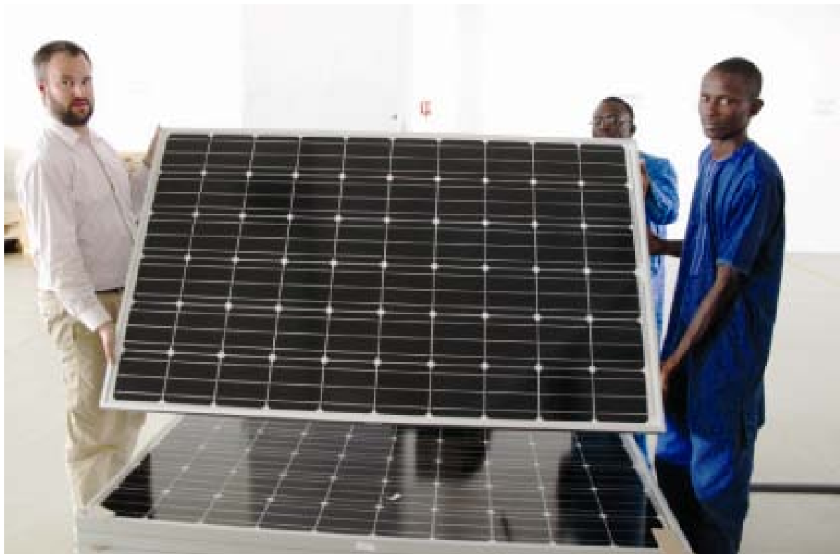
Solar panel production at the SPEC plant, Dakar, October 2012