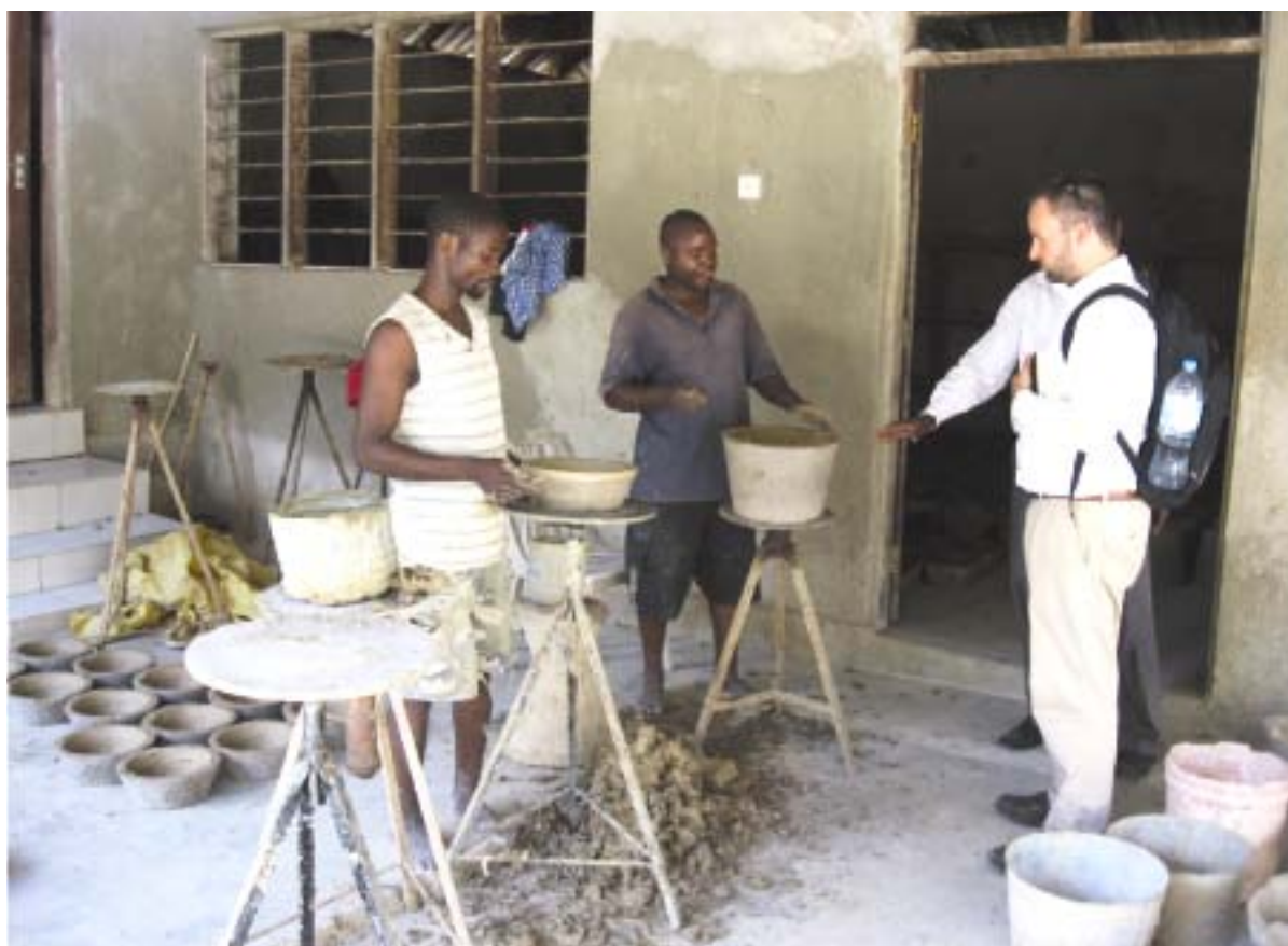
SEECO's production of clay linings for efficient cook stoves, Dar es Salaam, September 2012

SEECO operates as an independent company, though is majority owned by TaTEDO and is overseen by a board of directors. Given that TaTEDO shared the responsibility (with E+Co) for identifying and vetting entrepreneurial applicants to the AREED facility, as well as approving the business loans, this level of involvement with SEECO would appear to present a conflict of interest, though this was not recognised as an issue during the 2012 field research.