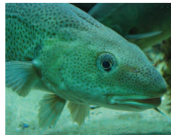
Fig.11. A grand challenge is to be able to identify intrinsic resistance and resilience and to recognize critical symptoms that signal an imminent regime shift. The cod collapse in 1983 in the North Sea is an example of a regime shift that induced a massive loss.

resources. Ocean acidification and deoxygenation are impacting these marine resources (Stramma et al. , 2011) and in particular marine biodiversity. There is accumulating evidence that climate change combined with future ocean acidification is particularly likely to affect pelagic microbial communities and benthic organisms (Turley et al. , 2010). As the ocean continues to absorb heat from anthropogenic climate warming, its oxygen content is expected to decline because surface heating reduces gas solubility, and inhibits mixing of O 2 rich surface water into the deeper ocean where O 2 is continually removed by microbial respiration (Stramma et al. , 2008; Keeling et al. , 2010, Deutsch et al. , 2011). The use of genomics has allowed for further investigation of the functioning of these OMZ marine ecosystems for instance in revising the nitrogen-loss pathways in the OMZ off Peru (Lam et al. , 2009). Moreover, OMZs are key regions in the climatic gas budgets such as CO 2 , N 2 O, CH 4 , DMS, halogenated compounds, impacting on climate variability. Multi-stressors research needs to be conducted to evaluate synergy between the different factors and their combining roles.