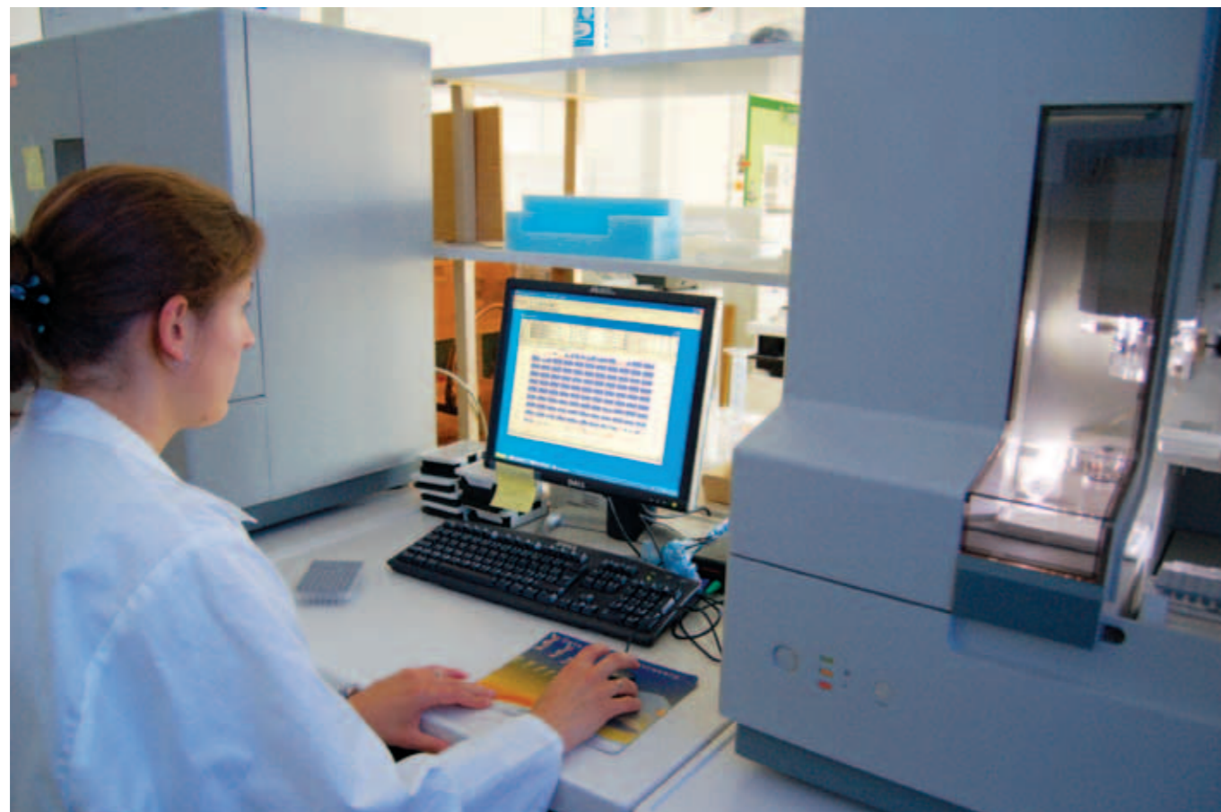
Fig.6. The potential of marine organisms for biotechnological advances that drive innovation in the development of new natural products, biocatalysts, biopolymers and biofuels is enormous. Genomic analyses of marine organisms is, among others, one of the targeted research areas that need further development.