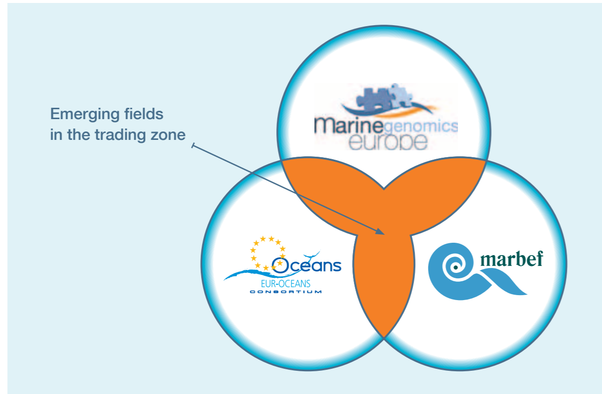
Fig.2. Emerging fields in the trading zone; where exchanges across disciplinary boundaries and interdisciplinary collaborations can lead to new concepts and new discoveries.

These emerging fields illustrate the added value of integrating the three former NoE scientific communities into a single consortium, namely EuroMarine that can inform and provide the priority actions for EuroMarine+. Priority should be given to, for instance, the organization of specific exploratory workshops in these emerging fields for research, training and education strategies.