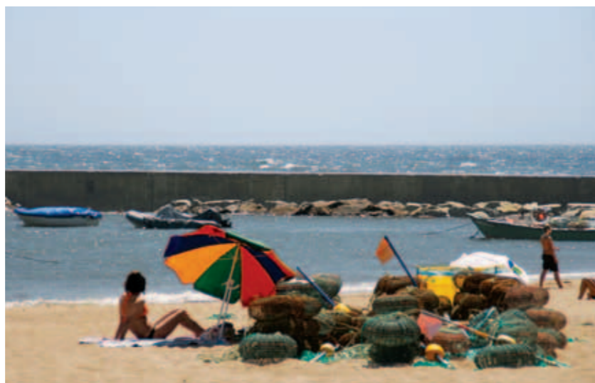
Fig.12. Marine ecosystems provide a range of services with socio-economic benefits of significant value to Europe. Evidence is growing that human induced changes in marine biodiversity and ecosystem functioning can, in turn, impact strongly on services and direct economic benefits to society, such as productive fisheries, aquaculture and tourism.

However, despite their widespread occurrence and fundamental importance impacting on every level of marine life, studies on marine rhythms are scarce. In order to understand marine biological processes they need to be explored now at the multidisciplinary level, reflecting the complexity of their impacts. The knowledge and skills represented in the three former NoEs, ranging from genomics and molecular biology to ecosystem analyses and computational modelling will provide the necessary framework to tackle and understand marine rhythms with all their complexity. Moreover, full quantification of the natural cycles is required to improve projections for the consequences of anthropogenic perturbations. Such a re-focus will be crucial to understand the principles, interactions and evolution of rhythms that govern a broad range of prokaryotes and eukaryotes, including ourselves.