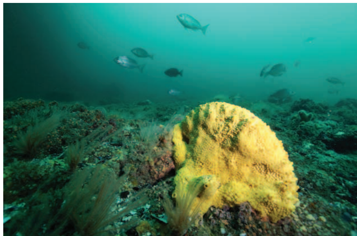
Fig.4. Europe aims to achieve a Good Environmental Status of its marine waters by 2020. In order to optimize sustainable use of the oceans we need to better understand ecosystem functioning at all scales, from the gene to the whole ecosystem.

Detailed knowledge of marine ecosystems is necessary not only to manage them but especially to restore them. For example, some experience already exists in restoration of kelp beds in California, where 18,500 m 2 of kelp were restored. No similar experiences exist in Europe, even though kelp beds are disappearing from some locations. Knowledge on the drivers of this loss and on the ecology and ecosystem functioning of these ecosystems is necessary to be successful in restoring them.