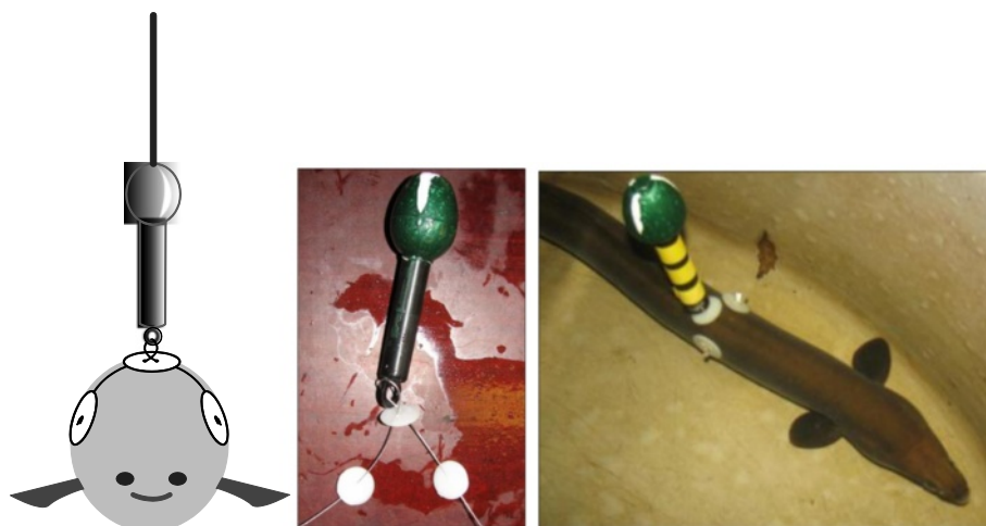
Figure 4 Illustration and photos of the Jellyman and Tsukamoto tagging method used to attach pop-up satellite archival transmitters to European silver eel. The method is slightly modified from the tagging method described by Jellyman and Tsukamoto [11-13].

A 25-mm-long wire with a loop in each end was made by twisting a 0.8-mm-diameter stainless steel wire. One