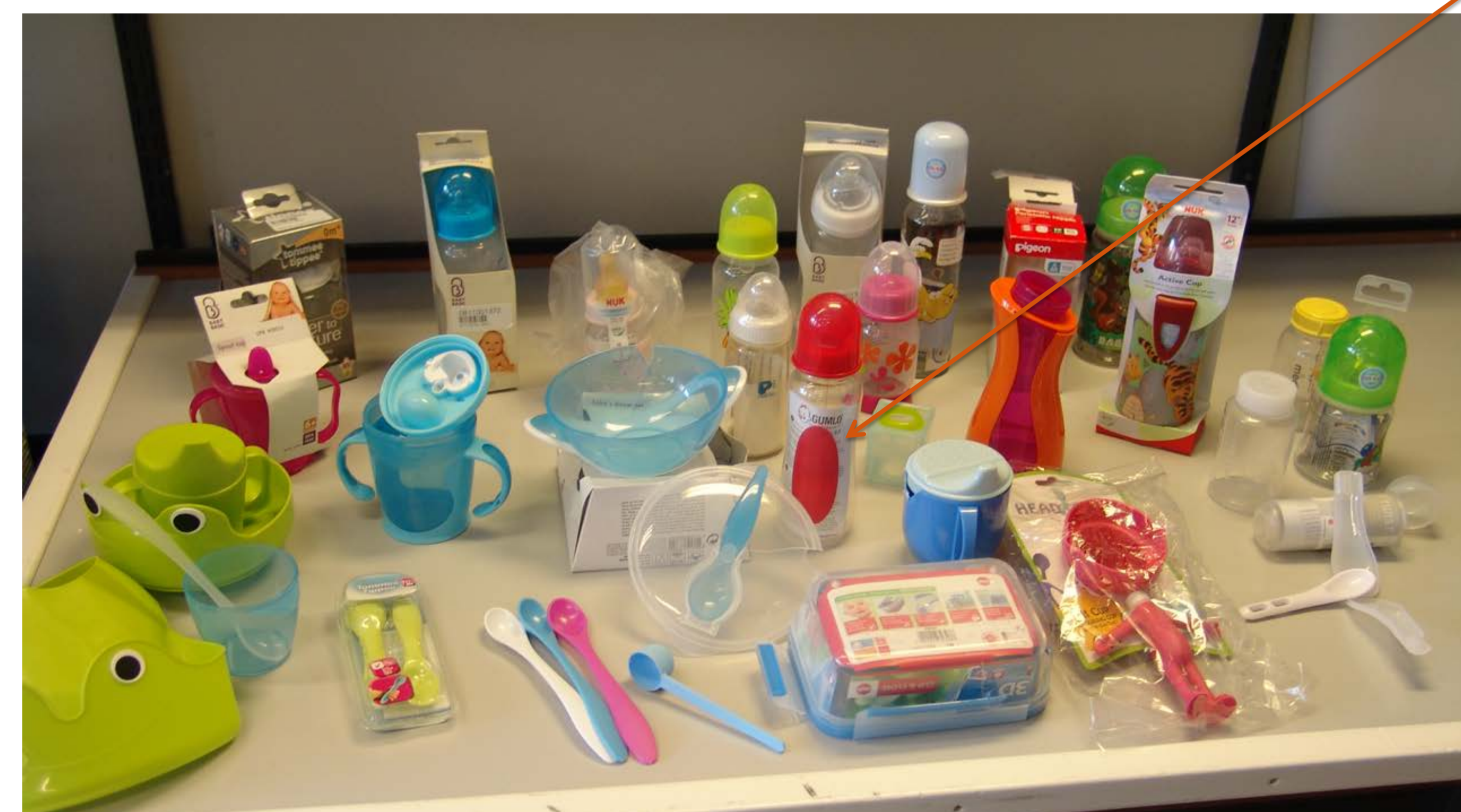
Figure 2. Selection of samples analysed in the campaign of 2011.

2) Identification and quantification of residual BPA in the polymer by LC-MS/MS (only 2011): The samples, including subsamples, were dissolved in suitable solvents and the extracts were analysed for bisphenol A by LC-MS/MS (ES-).