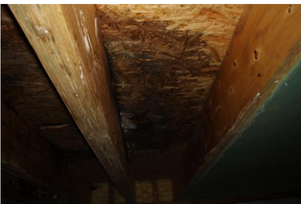
Figure 6: Wetted construction material from leaky construction.