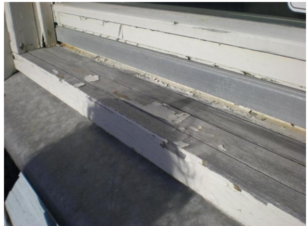
Figure 8: Window frame made without water deflecting details.