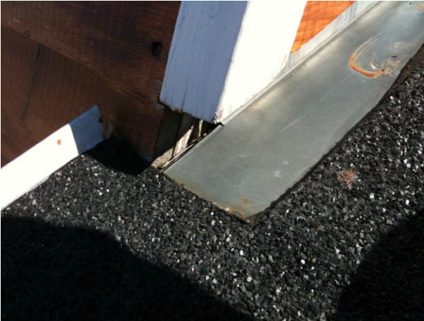
Figure 4: Wrong detailing of a flashing at a roof edge.