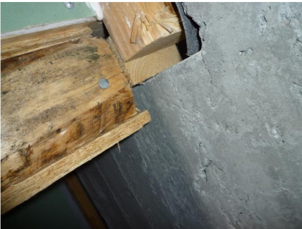
Figure 5: Poor fitting of the materials in a corner to each other. A leaky assembly.