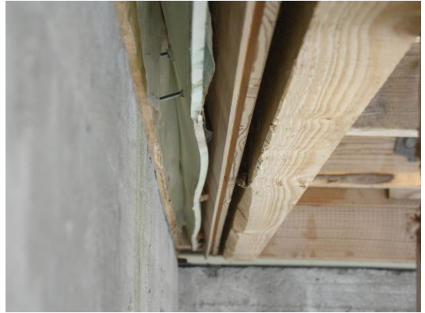
Figure 7: Sheathing membrane not attached correctly to the wooden members at the lower construction perimeter.