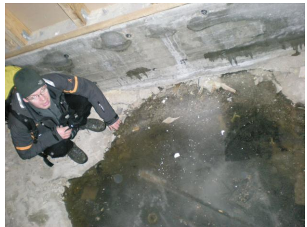
Figure 3: A lake of (frozen) water standing in the basement of a new building.

The pictures below show examples of constructions which have failed.