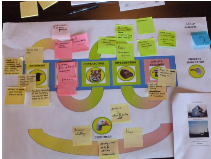
Fig. 1. Impression from the Business Zoo workshop (animal gathering canvas development).