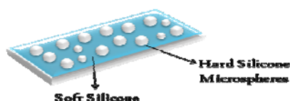
Figure 1. Soft silicone film with hard silicone microspheres

Poly(dimethylsiloxanes) (PDMS) have unique properties such as elastic behaviour and resistance to high temperatures, light degradation and chemical attack.[1] These exceptional features make cross-linked PDMS suitable for a wide range of applications such as in electrical and/or optical devices [2], anticorrosion [3], sealants and adhesives [4] and biomedical applications [5]. Furthermore an elastomer is a crosslinked polymeric material with the capacity of going back to its original size and shape after being deformed. The aim of this work is to prepare anisotropic silicone materials by curing hard silicone microspheres with soft silicone ( Fig.1 ) and studying the effects of hard silicone microspheres on the properties of polysiloxane elastomer. ( Fig.2 )