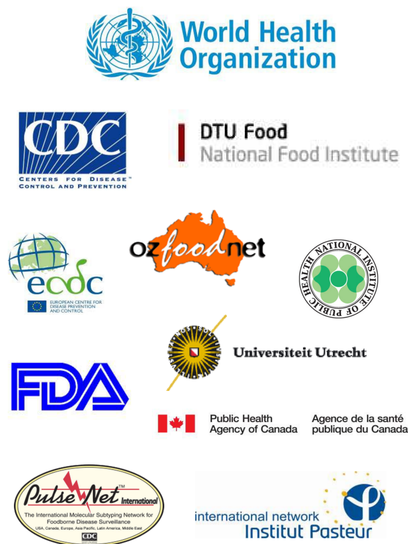
Figure 1: The GFN steering committee partners

EQAS enhances the capacity of national reference laboratories to obtain reliable data for monitoring and surveillance purposes worldwide.