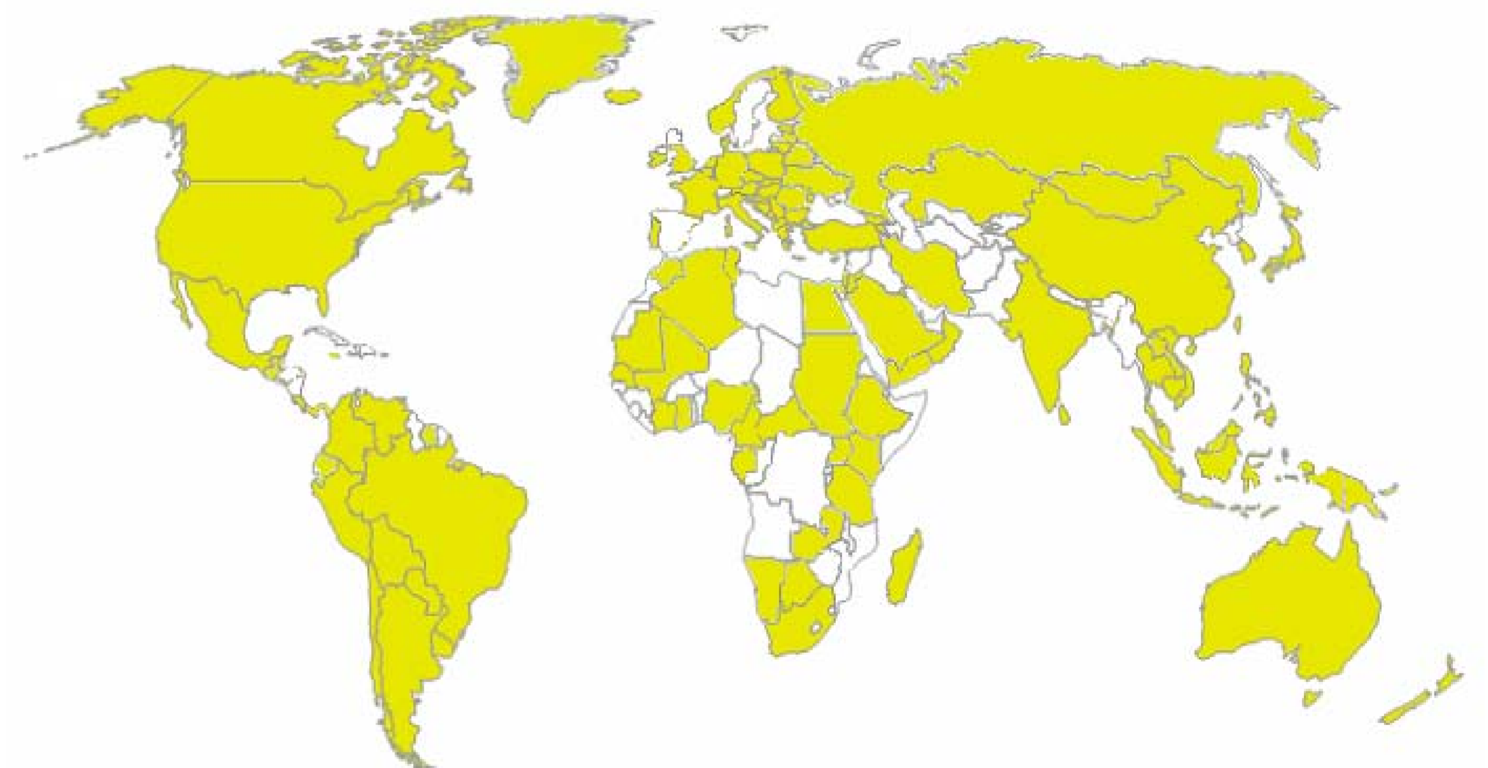
Figure 3: Marked with color are the countries from which one or more laboratories have participated in the WHO GFN EQAS in any of the iterations from 2001 to 2009 (the 2000-data are not included as they were not uploaded to the database)

Data from 2001 to 2007 are summarized and published 1 .