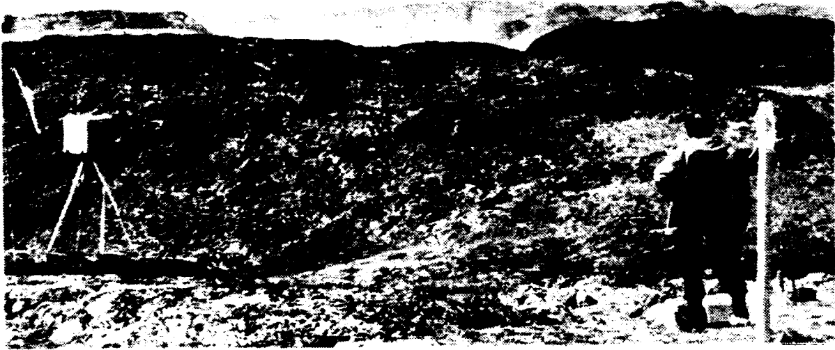
Fig. 2. View of the Kvanefjeld plateau with a TL dosimeter post in front to the right and the high-pressurized ionization chamber positioned behind to the left.