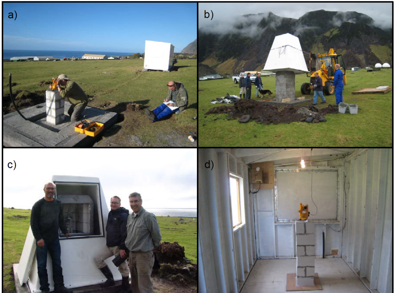
Figure 2. (a) Foundation of the variometer shelter with variometer pillar (left) and absolute hut (right) seen from west during sun observation on variometer pillar. (b) Mortar covered aerated concrete structure to be covered by pyramid-shaped fibreglass shelter for wind and rain protection. (c) Fibreglass shelter with open access door shows aerated concrete structure with open access window and variometer sensor. (d) View inside the absolute hut from east: DI-flux on pillar, window towards south, removable panel in wall towards west, and scalar magnetometer in the upper south-west corner.

For further protection against rain and wind, the aerated concrete structure is covered with a fibreglass shelter (Figures 2b and c) that is attached to the outer foundation (shown in Figure 2a). The shelter is pyramid-shaped (with a flat top) to withstand strong winds without the need for stay wires. The fibreglass shelter was prebuilt in South Africa (designed by DW). A wooden frame was constructed resembling a pyramid with flat roof. The frame was covered both inside and outside with plywood and the gaps in between filled with Isotherm (a polyester fleece) and painted inside. On the outside, the plywood was covered with four layers of lightweight fibreglass (chopped-strand mat), polyester-resin and finished with self-levelling polyester-resin mixed with white pigment for UV-protection and a high albedo (sunlight-reflection) for temperature stability.