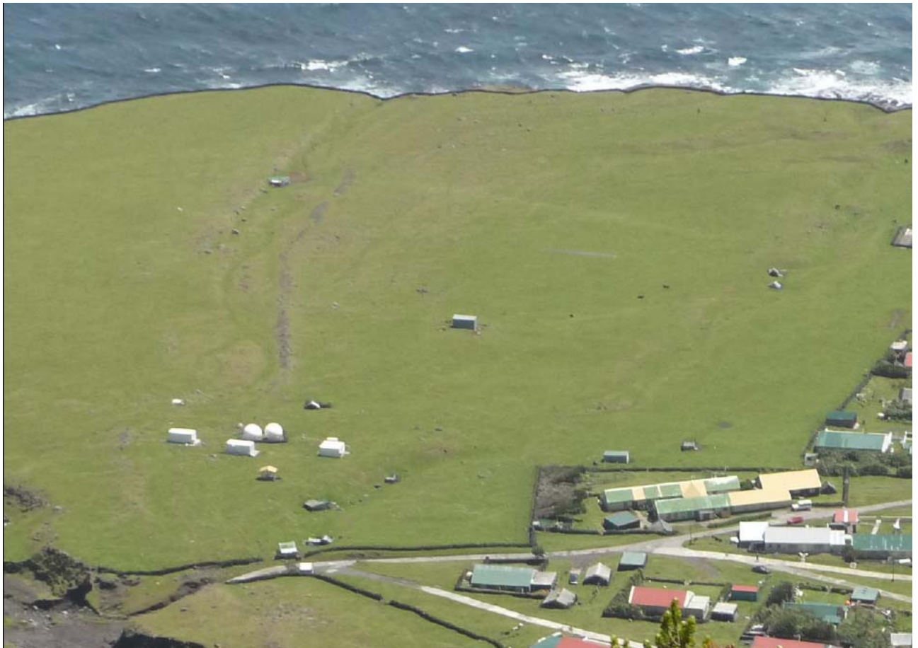
Figure 1. View from the South with the Tristan da Cunha absolute hut (centre). The edge of the gulch is shown on the left side in the foreground. Between the gulch and the absolute hut is the CTBTO monitoring station (approximately 140 meters from the absolute hut) and the settlement is to the east (approximately 110 meters). The variometer shelter was not yet established at that time.

The island is volcanic with strongly magnetised rocks, and the geomagnetic observatory was placed on the coastal plain with a smooth (and rather flat surface) to avoid magnetic gradients. The plain consists of horizontal lava flows overlain by volcanic sediments and soil. The remnant magnetisation of the volcanic material in the soil and sediment likely cancels out, so the magnetisation below the observatory should be mainly induced magnetisation. The location on the golf course was chosen to have maximum distance to the settlement, to the coast, and to a nearby gulch which carries volcanic gravel and boulders, see Figure 1. The coast and gulch were avoided because their topography could give rise to magnetic gradients and because erosion processes will move the magnetic volcanic material and thus change the local magnetic field bias. A preliminary total field survey of the area showed that the planned location had relatively small gradients compared to the area closer to the coast.