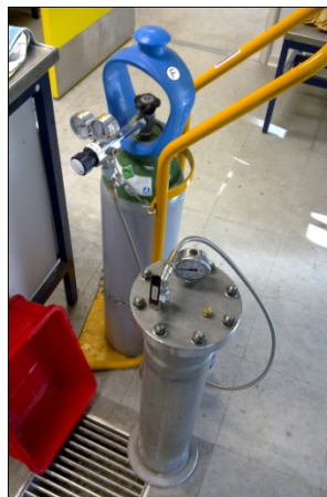
Figure 1 – The water pressure equipment at Rambøll Danmark A/S.

All of the experiments have been made on cylindrical concrete specimens with a height of 8 cm and a diameter of 10 cm. The curved sides of the specimens were painted with epoxy resin so that the chloride ingress could only take place through the top or the bottom of the cylinders. Before exposure of salt water all specimens were dried at 40 °C in 5 days. The specimens were exposed to a 10% NaCl 1 solution and were submerged into the salt solution through the experiments. At 100 kPa the specimens were exposed to salt water for 23 days. At 800 kPa the time for exposure depended on the w/c-ratio. Specimens at w/c = 0.35 were exposed for 1 day and specimens at w/c = 0.45 and w/c = 0.55 for 5 days. Figure 1 shows the water pressure equipment used for the experiments at 800 kPa.