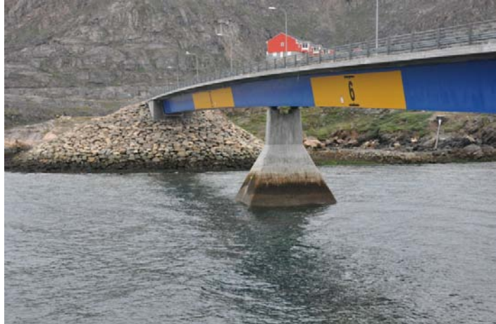
Figure 1 - The pillar on the Ulkebugt Bridge.

The concrete pillar is exposed directly to seawater, as it is shown in Figure 1. The pillar is founded on the seabed, so a major part of the concrete surface is constantly under water and thereby exposed to chloride ingress by capillary suction and diffusion. The ingress is relatively slow under water in this dense concrete and due to lack of oxygen there is no real concern for chloride driven corrosion. The most critical part on the surface is in the splash-zone with tide and wave action. In the Ulkebugt the tide has a variation of around 4 meters. The chloride ingress in the splash-zone gives the best opportunity to estimate the lifetime on the concrete pillar.