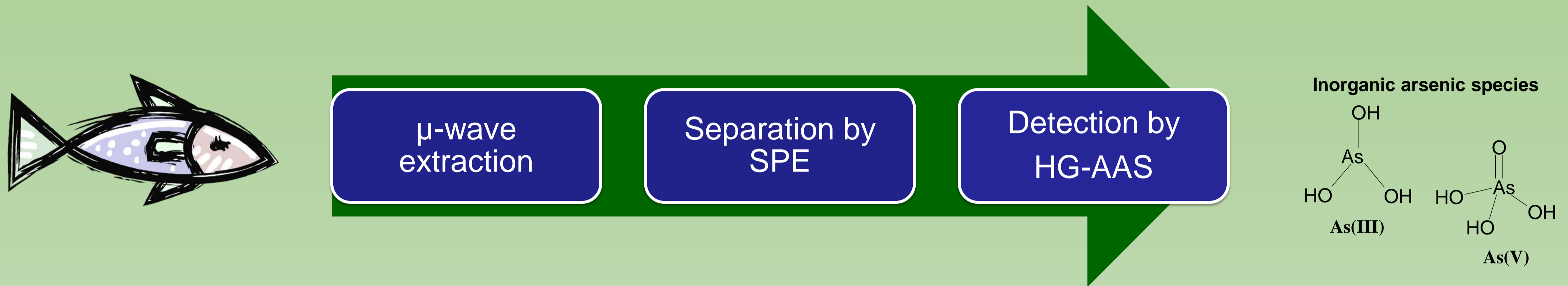
FIGURE 1. Principle of the MAE-SPE-HG-AAS approach for selective speciation analysis of inorganic arsenic.

Simple, inexpensive and fast methods for determination of the toxic inorganic arsenic species are called upon for the monitoring and control of food and feed samples. A simplified approach based on Microwave-Assisted Extraction (MAE) - Solid Phase Extraction (SPE) – has been developed, where inorganic arsenic is separated from organoarsenic compounds by Strong Anion Exchange (SAX) SPE followed by determination of arsenic content by Hydride Generation (HG) Atomic Absorption Spectrometry (AAS).