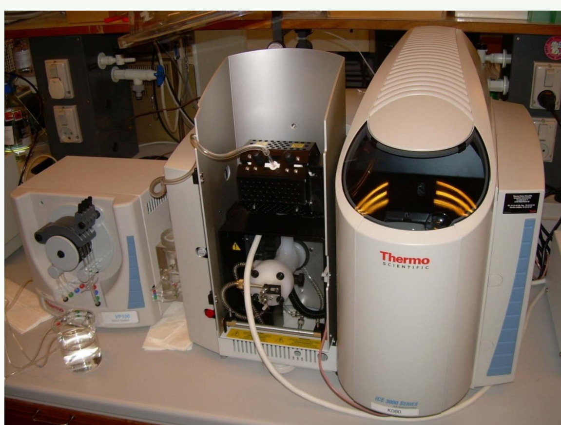
PICTURE 1. ICE 3300 AAS from Thermo Scientific with a VP100 for hydride generation system and an electrically heated cell.

* Target level established by measurements with reference method HPLC-ICPMS.