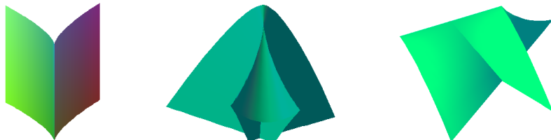
FIGURE 1. Left to right: Cuspidal edge, swallowtail and cuspidal cross cap.

In this article we will encounter three standard singularities: the cuspidal edge , given by f(u, v) = (u^2, u^3, v) , the swallowtail given by (3u^4 + u^2v, 4u^3 + 2uv, v) and the cuspidal cross cap given by (u, v^2, uv^3) (Figure 1). The first two singularities are fronts, but the third is only a frontal.