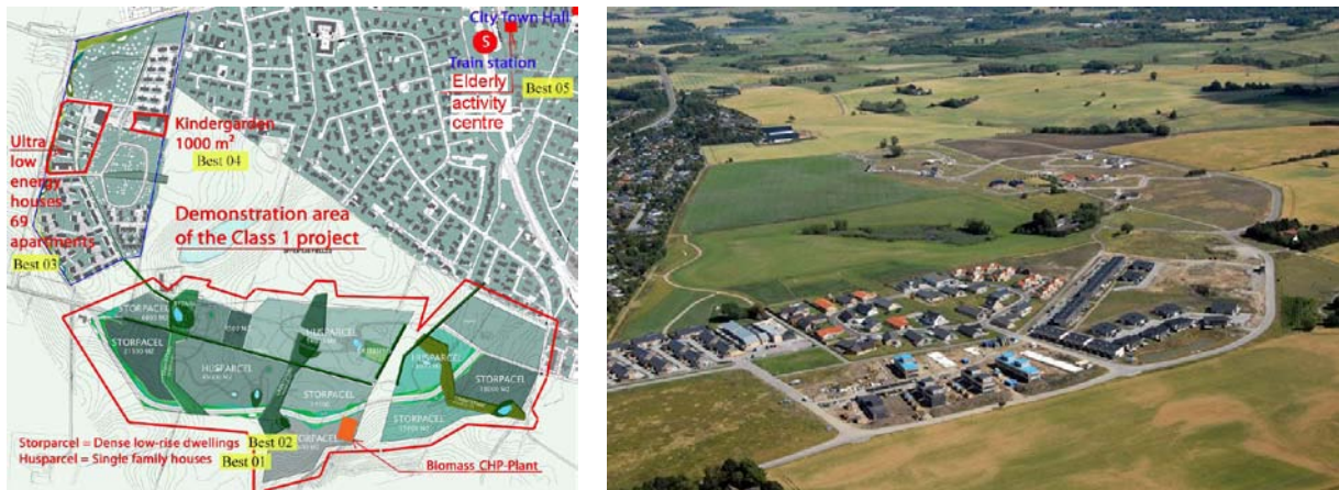
Figure 1: Site area (left) and status of the settlement in 2010 (right).