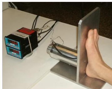
Fig. 2: Indentation device.

The indentation device is made of a load cell (RDP Electronics model 31) and a linear transducer (RDP Electronics LVDT Displacement Transducer), both connected to amplifiers (RDP Electronics E725) and assembled inside an aluminium cylindrical body. An additional large screw is needed for the indentation test. This is placed at the bottom of the cylindrical body. A circular shaped sensor ( \Phi=40 mm) is attached to the load cell at the other extremity (see Figure 2). The more the screw is tightened in, the more compression is applied to the heel pad by the sensor. The real displacement of the heel pad tissue starts from when the sensor touches the skin of the heel and the load cell shows an increasing load. Until the load is zero, the recorded displacement is only the feed of the sensor. For the present experiment five compressions are applied with an interval of 10 minutes between each trial, allowing the tissue to relax. Data are then acquired and processed by using LabVIEW and Excel.