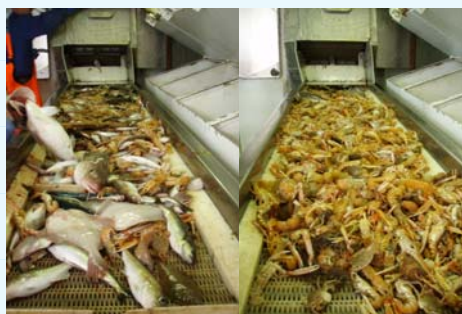
Fig. 2. Catch from an unselective trawl (left) and a catch from a selective trawl using a sorting panel (right).