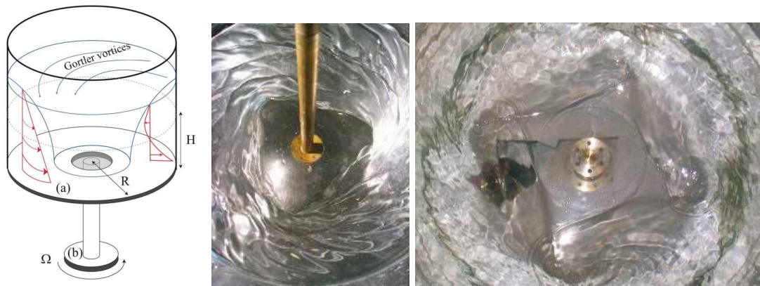
FIG. 2 (color online). Left: Sketch of the flow in the axially symmetric basis state on top of which the rotating polygons form. The plate (a) is rotating with angular velocity \Omega , driven by a motor (b), the fluid above the plate is pressed radially outward, and a secondary flow develops as sketched. Center: Triangle formed spontaneously on the surface of ethylene glycol in a cylindrical container over a rotating plate (small setup). Note the “Görtler vortices” spiralling on the surface. Right: A rotating square on water. Note the vertical vortices just outside of the corners.

variation, there is a tendency for mode locking such that the polygons rotate by one corner for every complete rotation of the plate. In the case of ellipses ( N = 2 ), we have even observed mode locking in the ratio 2/3 . This must be related to the slight wobbling of the plate, which, although minute, breaks the axial symmetry [5].