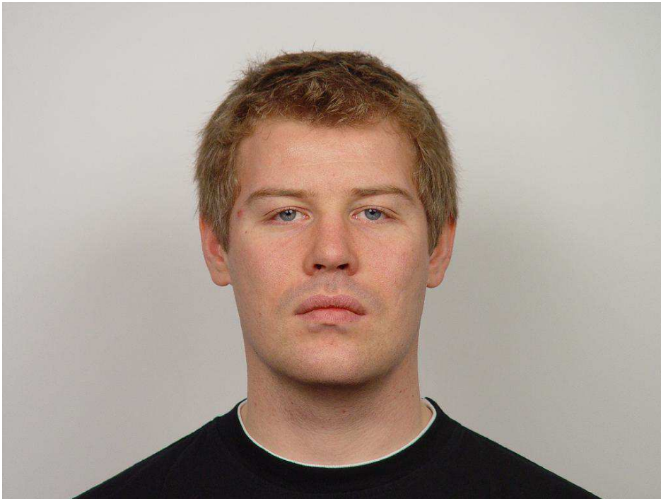
Figure 3: Example of a full size image.