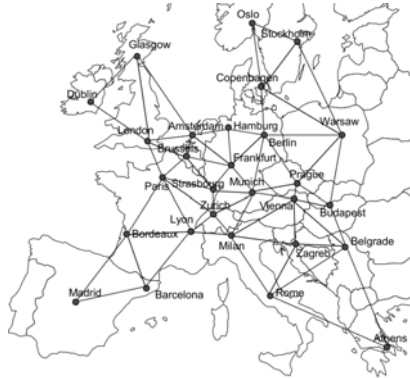
Figure 2: Pan-European triangular topology network [10].

We are using OPNET Modeler [9], a commercial discrete event simulation tool, combined with CPLEX-based off-line optimization to simulate connection allocation in a GMPLS-controlled network. As a test instance, we are using the Pan-European topology [10] illustrated in figure 2. The network consists of 28 nodes and 61 links, each equipped with one fiber of 10 wavelengths per direction.