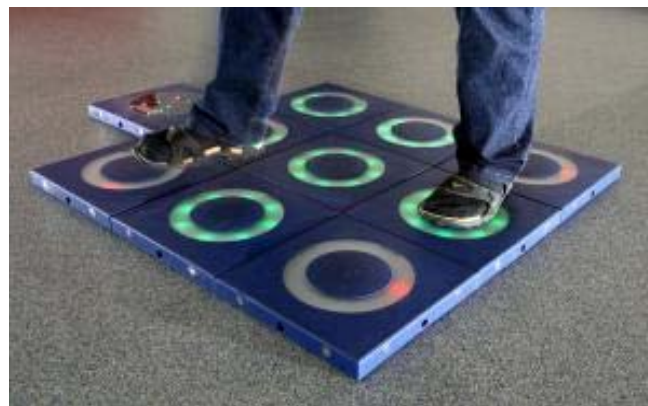
Fig. 1. Modular robotic tiles used for playful physiotherapy.

H. H. Lund is with the Center for Playware, Technical University of Denmark, Building 325, 2800 Kgs. Lyngby, Denmark (phone:+45 45253929; email: hhl@playware.dtu.dk ).