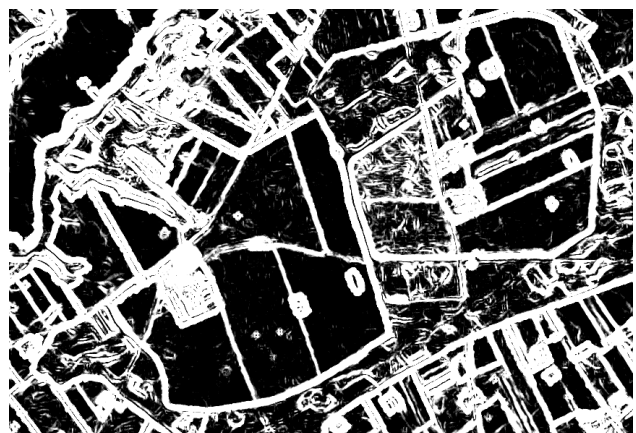
Fig. 4. Edge detection using azimuthal symmetry