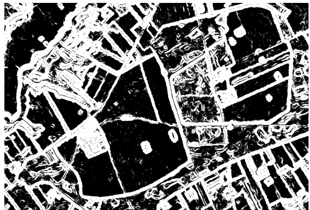
Fig. 3. Edge detection using diagonal elements