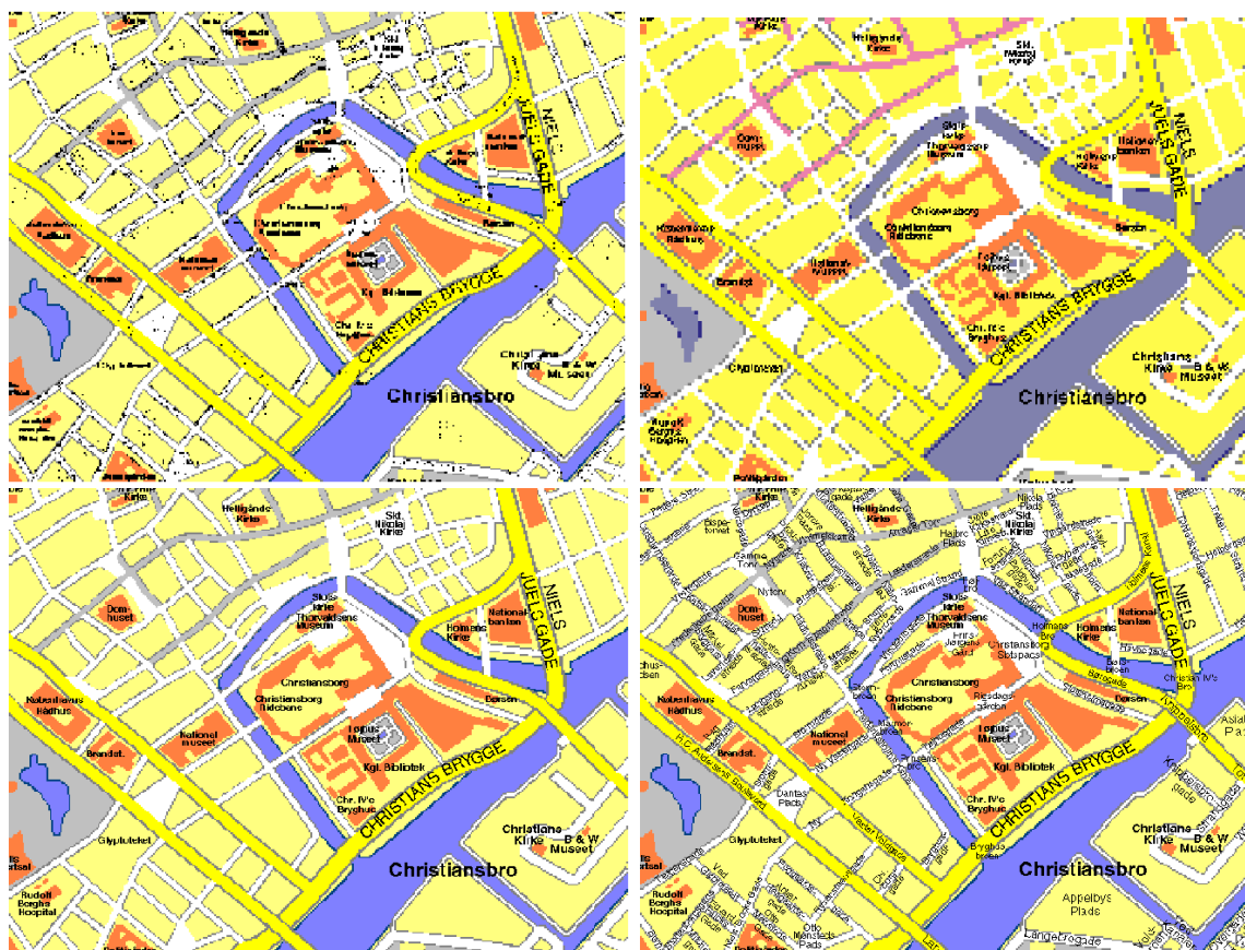
Figure 2: Progressive coding. Test image of map (city center of Copenhagen). Upper left) Resolution layer ( rl ) 1 (8262 bytes to this point). Upper right) Background rl 2 and text sub-layer ( sl ) 1+2 of rl 1 (3305 bytes to this point). Lower left) Background rl 1 and text sl 1+2 of rl 0 (8281 bytes to this point). Lower right) Background rl 1 and full text rl 0 (15483 bytes to this point).