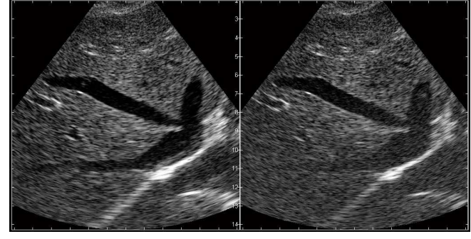
Figure 2: Presentation of image pair cine-loops. In this case the left is coded and the right is a conventional image.

For each of the 27 image pairs, two cine-loops were created. The images were cropped below the depths: d_{magiq} and d_{maui} calculated for each image pair from the answers to Questions 1 and 2: