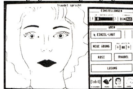
Figure 1. LIPPS user interface showing a schematic face

may also be combined with learning of sign language gestures or language-related sign language.