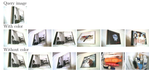
Figure 2. First 6 images retrieved using 11 dimensional vectors with and without color. With color the highest ranked images looks alike, whereas without color number 5 and 6 are quite different from the rest. This was observed as a general trend.

To test the effect of using color added SIFT features and LF-clustering we have made experiments with and without color features and with ordinary k-means and LF-clustering.