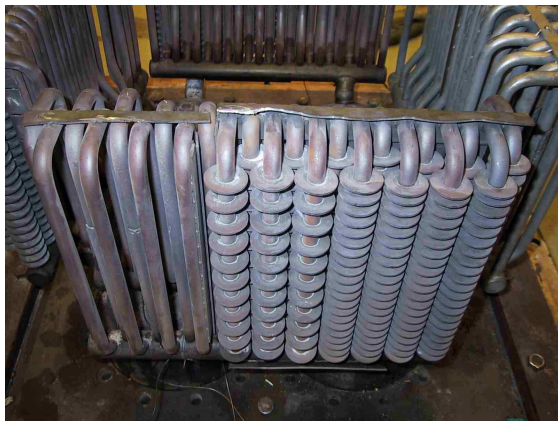
Figure 4: Two photos of the heater tubes of the Stirling engine. The four cylinders of the Stirling engine can be seen in the middle of the top picture. A sheet of heat resistant stainless steel separates half of the heater tubes from the combustion chamber and these tubes are therefore not exposed for radiation from the chamber.

Of the heater tubes only about two thirds are exposed for radiation. The remaining tubes are separated from the combustion chamber with a steel sheet. The hot combustion products radiate heat to the exposed heater tubes and are then lead past the remaining heater tubes where heat is transferred mainly by convection. An aim of the combustion system design is to ensure that the heat load is distributed evenly between the 23 U-shaped heater tubes of each cylinder. For further information about the Stirling engine design, see [1].