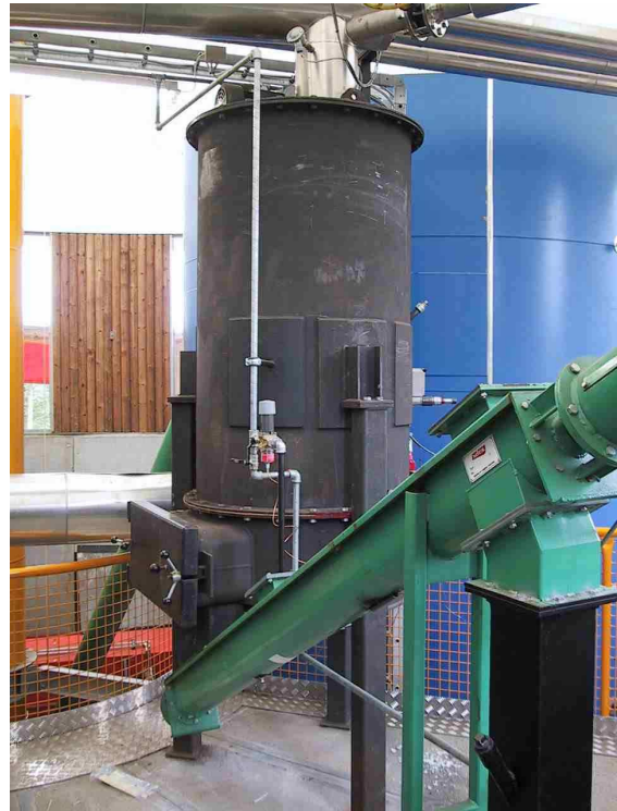
Figure 3: Photo of the updraft gasifier of the demonstration plant. The screw conveyor for the ashes is seen in the front of the picture and the wood chips screw conveyor can be seen in the background. The producer gas is taken out through the pipe in the top of the gasifier.