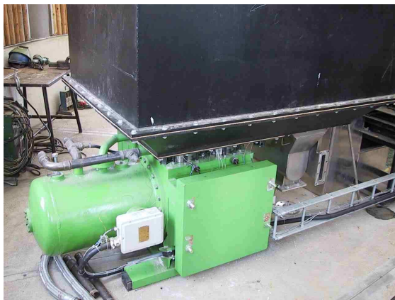
Figure 2: Photo of the Stirling engine.

Photos of the Stirling engine and the updraft gasifier of the demonstration plant are shown in Figure 2 and Figure 3.