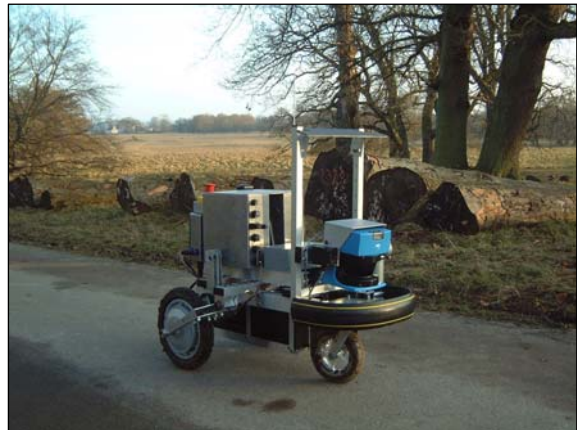
Figure 1: The robot platform tested in the dirt-road semi-structured environment from a Danish national park.

terrain using a 3D laser scanner by checking if all measurements in the vicinity of a range reading had less than a few centimetres deviation. Wallace et al (1986) used a vision-based edge detection algorithm to identify road borders. Jochem et. Al (1993) followed roads using vision and neural networks. Macedo et al (2000) developed an algorithm that distinguished compressible grass (which is traversable) from obstacles such as rocks using spatial coherence techniques with an omni-directional single line laser.