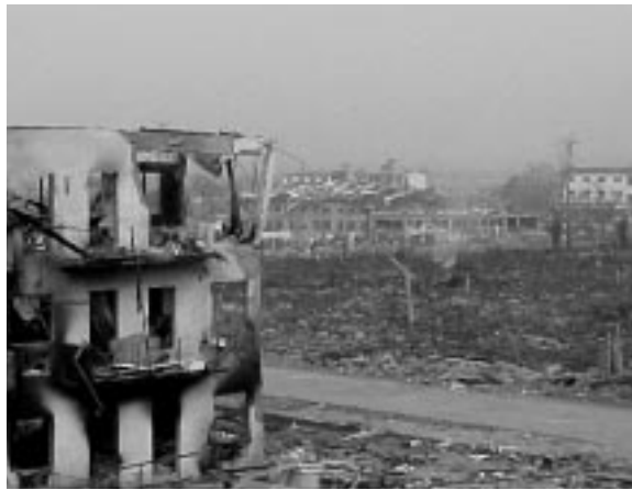
Effects of ammunition storage area explosion, Lagos, Nigeria, 27 January 2002

Risks can only be kept at tolerable levels if the ammunition management systems and storage infrastructure are to appropriate standards or in accordance with 'best practices'. A recent desk study by the Geneva International Centre for Humanitarian Demining (GICHD), 21 supplemented by some further research at SEESAC, has identified a significant number of recent explosive events that have occurred due to inappropriate storage or explosive safety procedures. Table 1 lists some recent explosive events at ammunition storage areas. The research data was obtained from Internet searches and a very limited response to a formal request for information. 22 It is no doubt incomplete: there are probably very many more incidents that have yet to be identified. Moreover, appearance on this list should not allocate or imply blame for the explosive event. Due to the patchiness of public information, appearance on this list may be testimony to the transparency and willingness of the State authorities involved to identify and learn lessons: many authorities take a less responsible approach.