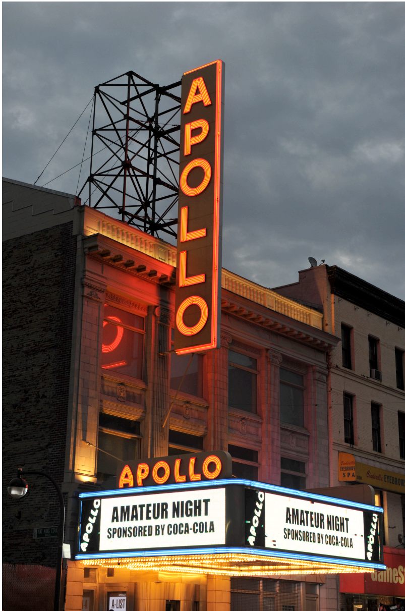
Fig 5. The façade of the Apollo Theater. The red neon Helvetica sign has hung on the neoclassical façade since the 1940s.