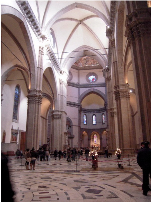
Fig. 1. The interior of S. Maria del Fiore Cathedral. The Gothic arches recall the medieval era, but the light interior shows some element of the humanism characteristic of the Italian Renaissance.

Another indication of the changing philosophical tides lies within the interior of the church, as seen in Figure 1. The light interior contrasts with the darkness of the medieval and Gothic churches that precede it. This lightness is a result of the beginnings of Renaissance Humanism, which regards man as an essentially good being, contrasting with the existing Christian notion of man's need for salvation from original sin. 13 The use of lightness in churches during this time was meant to mimic the lightness and clarity of mind that should come with knowledge of God, instead of the darkness and spirituality of the preceding centuries.