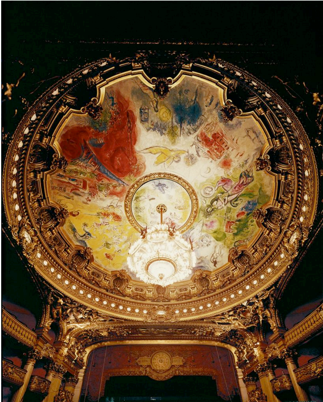
Fig. 4. The ceiling above the auditorium. Chagall's 1964 work contrasts with the heaviness of the gilt detailing surrounding the painting.