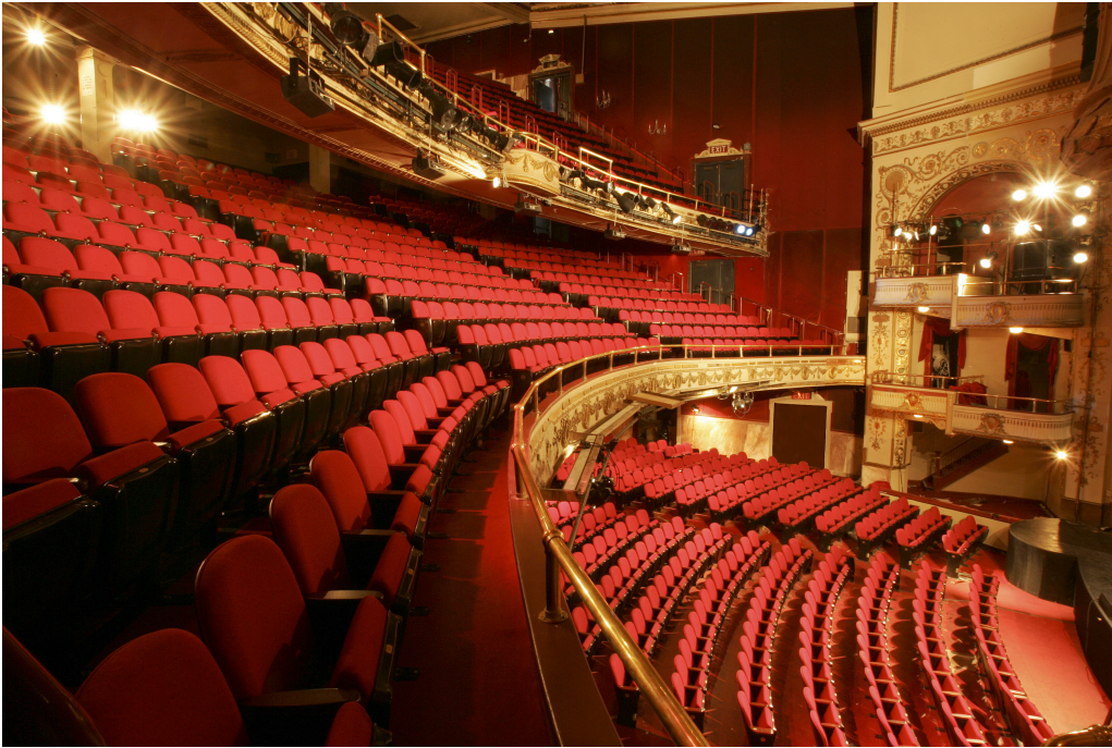
Fig 6. The Apollo Theater interior. The interior has been restored to the original detailing.