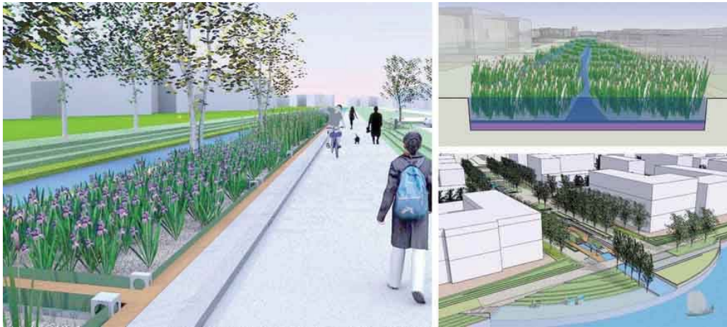
Figure 3: Plants for remediation and waste treatment are green infrastructure as a changing landscape for sensual experience . (Lynch et al, 2008)

and waste water treatment that reduces burdens on existing urban infrastructure. Remediation and self-sustaining systems introduce new landscapes of sensual experiences. The Veringkanal becomes the central spine for arterial lateral branches. Stormwater is collected from the adjacent neighborhood and flows into the canal. These branches simultaneously create a new trail system for pedestrians and cyclists and make the Veringkanal an urban greenway (Figure 3).