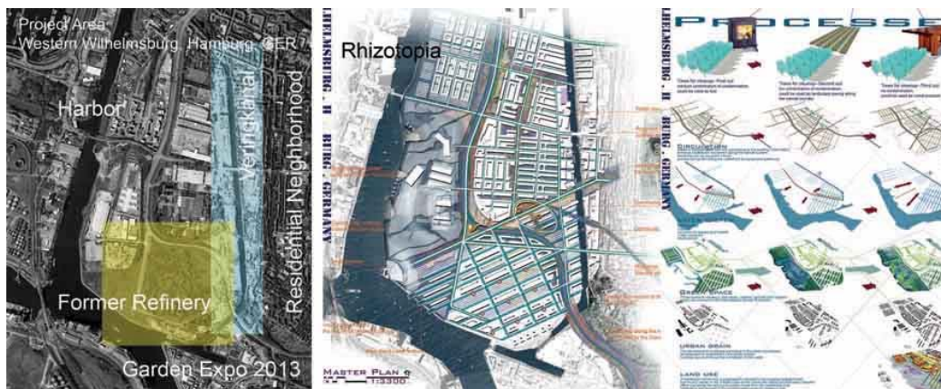
Figure 1. Project Areas - The remediation network provides the framework for a multi layered green infrastructure as design system. (Samimi, Wang, 2007)

The proposal for a “Remediation infrastructure as a green infrastructure framework” transforms the contaminated waste landscape into a healthy urban landscape that is well integrated with the city. The reed and grass planted remediation ditches and multi-lane alleys of fast-growing, deep rooting hybrid poplars and willows become part of the street and pedestrian circulation network that structures the urban form for the future and connects to the existing neighborhood (Figure 1). After the area is cleaned up, the water remediation network can be transformed into a surface stormwater treatment system and the multi-lane alleys can become street boulevards.