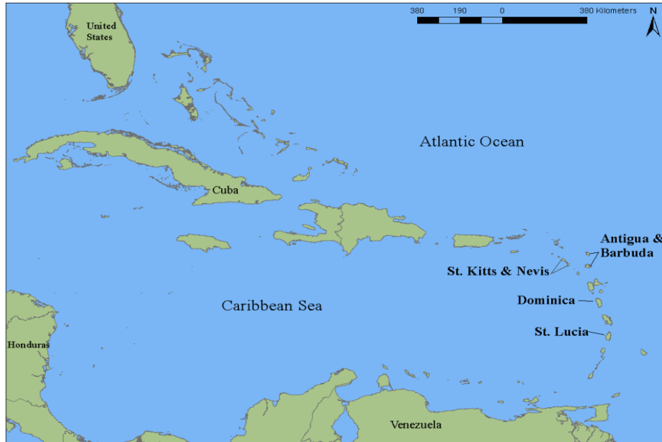
Figure 2 Comparative Islands Location (ArchGIS, World Countries 2011)