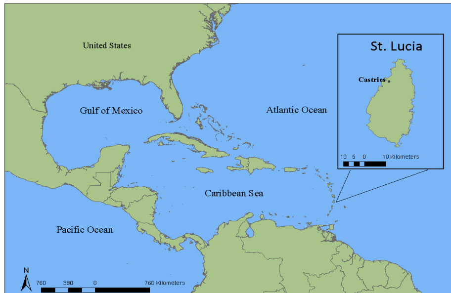
Figure 1 Caribbean Region and St.Lucia (ArcGIS, World Countries 2011)

The 616 sq km island of St. Lucia is part of the Windward Islands group of the Lesser Antilles. It is 43km N-S and 14km E-W and has a total coast line of 158km. The French island of Martinique is located to the North of St.Lucia with the islands of St.Vincent and the Grenadines to the south. Like many other Windward Islands, St.Lucia is a volcanic island dominated by high mountainous peaks and a lush interior rain forest. St.Lucia's most famous mountain peaks, Gros Piton and Pitit Piton, are located along the southwestern coast of the island and are part of a UNESCO World Heritage site; The Pitons Management Area. St.Lucia's highest peak, Mount Gimie, rises 958m above sea level and is located in the