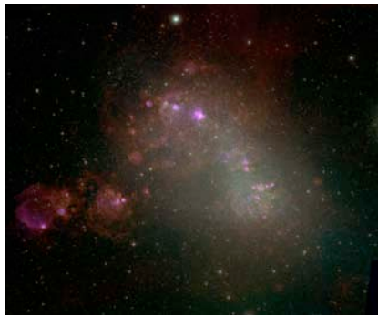
Figure 1: MCELS Mosaics of the Magellanic Clouds – this survey would offer the same coverage but at a much higher resolution and greater depth to answer a whole new set of scientific questions.

Comparison with the quantitative field massive star populations, as well as those in OB associations (see below) will provide unprecedented constraints on feedback parameters such as ionizing fluxes, stellar wind power, and elemental enrichment. It will be possible, with this survey dataset, to quantify and parameterize the spheres of influence of massive stars as a function of mass and interstellar conditions, for the three feedback effects.