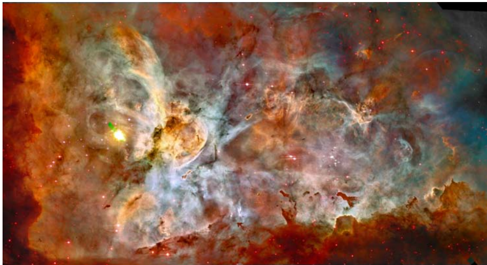
Figure 1 – the HST mosaic of the Carina Nebula (Smith et al 2008). This is the kind of dataset that, when replicated across all massive star forming regions within 2-2.5 kpc of the Sun, will yield a dataset capable of unlocking the secrets of star formation as a global process

Observations, theory and numerical simulations have led to major paradigm shifts in this simple description of star and planet formation. First, the birth of isolated stars from a quiescent dark cloud is rare. Observations have shown that most stars form in turbulent giant molecular clouds with supersonic motions having Mach numbers of 10 to 100. Second, most stars form in dense clusters in close proximity to tens, hundreds, or even thousands of other stars. Some siblings are massive stars with powerful stellar winds, intense UV radiation fields, and violent and explosive deaths that dramatically affect the surrounding ISM. The vast majority of normal stars, probably including our own Sun, formed in such OB associations. Feedback of light, energy, and matter drives and regulates cloud formation, gravitational collapse, and the properties of the individual stars, multiple systems, and the clusters that form. These stochastic turbulent processes appear to be fundamental to understanding the origin and distribution of stellar masses and other stellar properties.