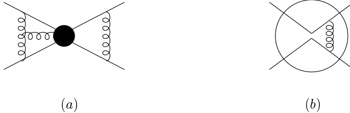
FIG. 1. Scales in the weak transitions: (a) Long range, (b) Short range.

The most obvious candidates for the basis of weak nonleptonic operators are those with dimension six, formed as the product of two currents,