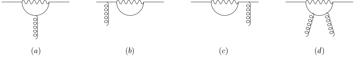
FIG. 4. QCD penguin vertex in the full theory.