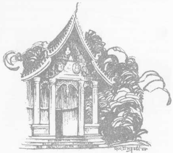
PAGODA IN A PROSPEROUS LAO VILLAGE

tribal people are often cheated in the market place and exploited as corvée labor (though this practice has been officially forbidden), but it is also true that there are long-standing reciprocal trading relationships which have existed between Lao farmers and different mountain tribes. Lao villagers speaking tribal languages have often acted as intermediaries between the tribal people and the Lao government. During the time of the French, when head taxes were imposed, these lam (interpreters) paid the taxes for their tribal associates; in return, the lam received forest products such as bamboo, betel, and wild game, plus the labor of the mountain people.