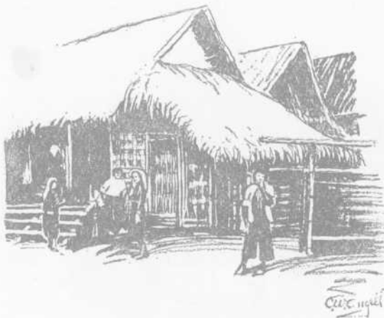
A LAO VILLAGE STORE

IT WOULD be easy to say that the dominant Lao have exploited the tribal peoples, the Communists have cultivated them, and American policy has ignored them. There are elements of truth in this, but the