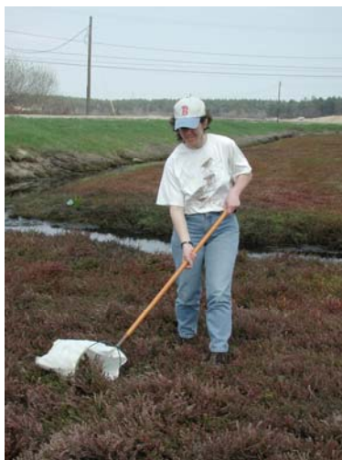
Scout using a sweep net to monitor for insects on a commercial cranberry bog.

Conduct soil and tissue tests at recommended intervals and keep the results.