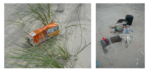
Figure 1: Marine litter on the beach of Juist (NorthSea)

In the last decades, marine litter has become ubiquitous and has adverse impacts on marine animals through entanglement of mammals, reptiles, sea birds, fish and other animals in discarded and lost fishing gear and other plastic litter items, as well as through ingestion, especially of micro- and mesoplastics, by vertebrates and invertebrates (Figure 1). As part of a project embedded in the implementation of the Marine Strategy Framework Directive (MSFD), we were commissioned to analyze data from monitoring of marine litter, including microplastics, on beaches and in other compartments of the marine environment. Spatial and temporal trends should be identified, and results should be used to classify European marine waters according to their level of pollution with marine litter. Prior to evaluation, indicators of the Good Environmental Status (GES) should be defined, such as the existing OSPAR-EcoQO on the amount of plastic in the stomachs of northern fulmars. Finally for all marine compartments, recommendations for future monitoring of marine litter have to be given.