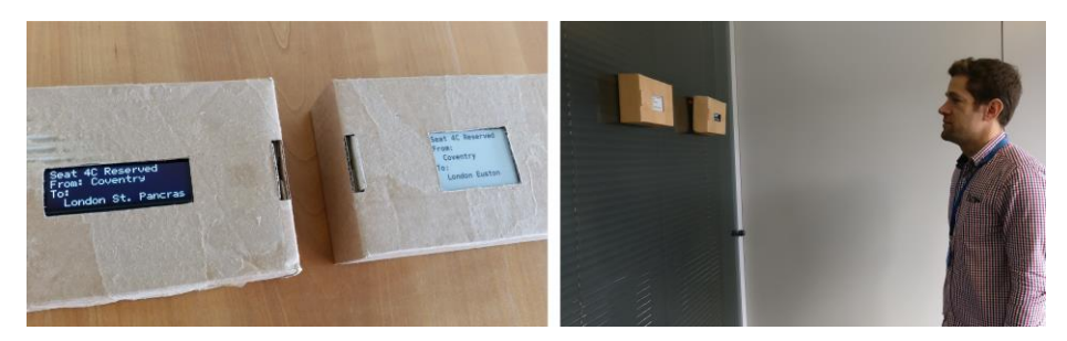
Fig 2. (L) The two displays in the casing used during the study and (R) the study setting

first, and then this display would be replaced with the second option. The trials consisted of a counter-balanced A-B / B-A design [9] where half of the subjects started with the OLED and the other half with the E-ink display. This alternation was used to minimize biases that could emerge from the order of presentation of displays, which could influence the results.