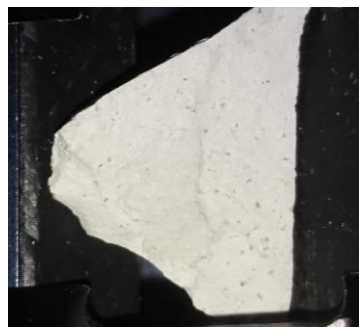
Figure 2: BRSL: Example of sample image (corresponding to Fig. 1). The figure shows an image of a bulk sample of buddingtonite, an ammonium-feldspar.